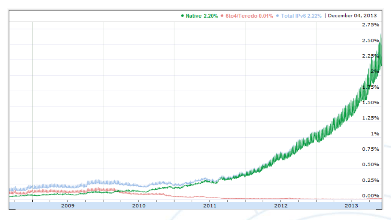
Figure 5. IPv6 connectivity of Google Users

There are other valuable resources on this subject as well. The 'World IPv6 Launch' initiative, which is hosted at <a href="http://www.worldipv6launch.org">http://www.worldipv6launch.org</a>, could be considered for IPv6 development discussions and usage statistics. There are a number of IPv6 usage measurement activities listed on the website.<sup>9</sup>