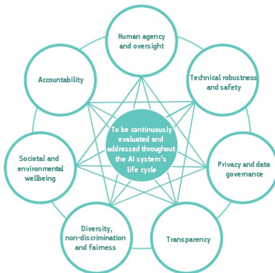
Figure 2: Interrelationship of the seven requirements: all are of equal importance, support each other, and should be implemented and evaluated throughout the AI system's lifecycle

While all requirements are of equal importance, context and potential tensions between them will need to be taken into account when applying them across different domains and industries. Implementation of these requirements should occur throughout an AI system's entire life cycle and depends on the specific application. While most requirements apply to all AI systems, special attention is given to those directly or indirectly affecting individuals. Therefore, for some applications (for instance in industrial settings), they may be of lesser relevance.