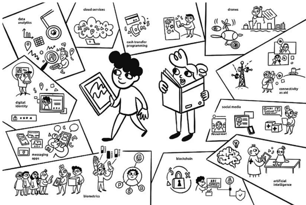
Figure 1. Use Cases for Humanitarian Data Processing.

the collection of evidence of abuses of rules of international humanitarian law (IHL).